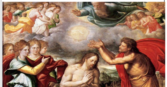
The Baptism of the Lord- https://www.thoughtco.com/the-baptism-of-the-lord-542465